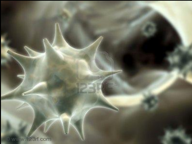
Colony of pathogen viruses