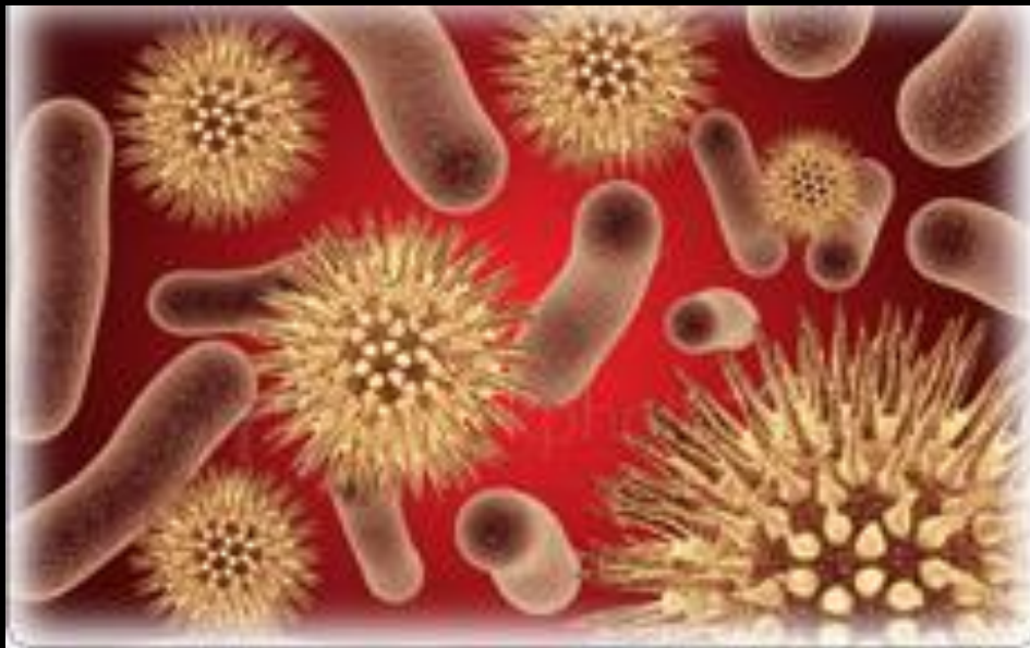
Airborne pathogens : microbes, bacteria, viruses